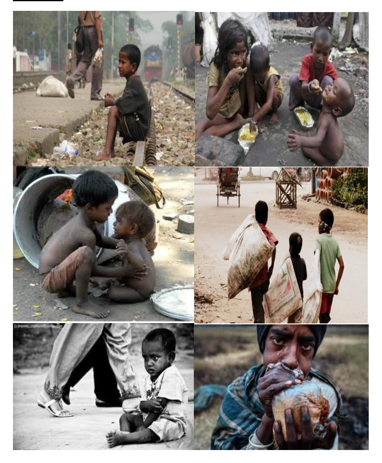
Here are some pictures of the current deplorable condition of street children in Bangladesh